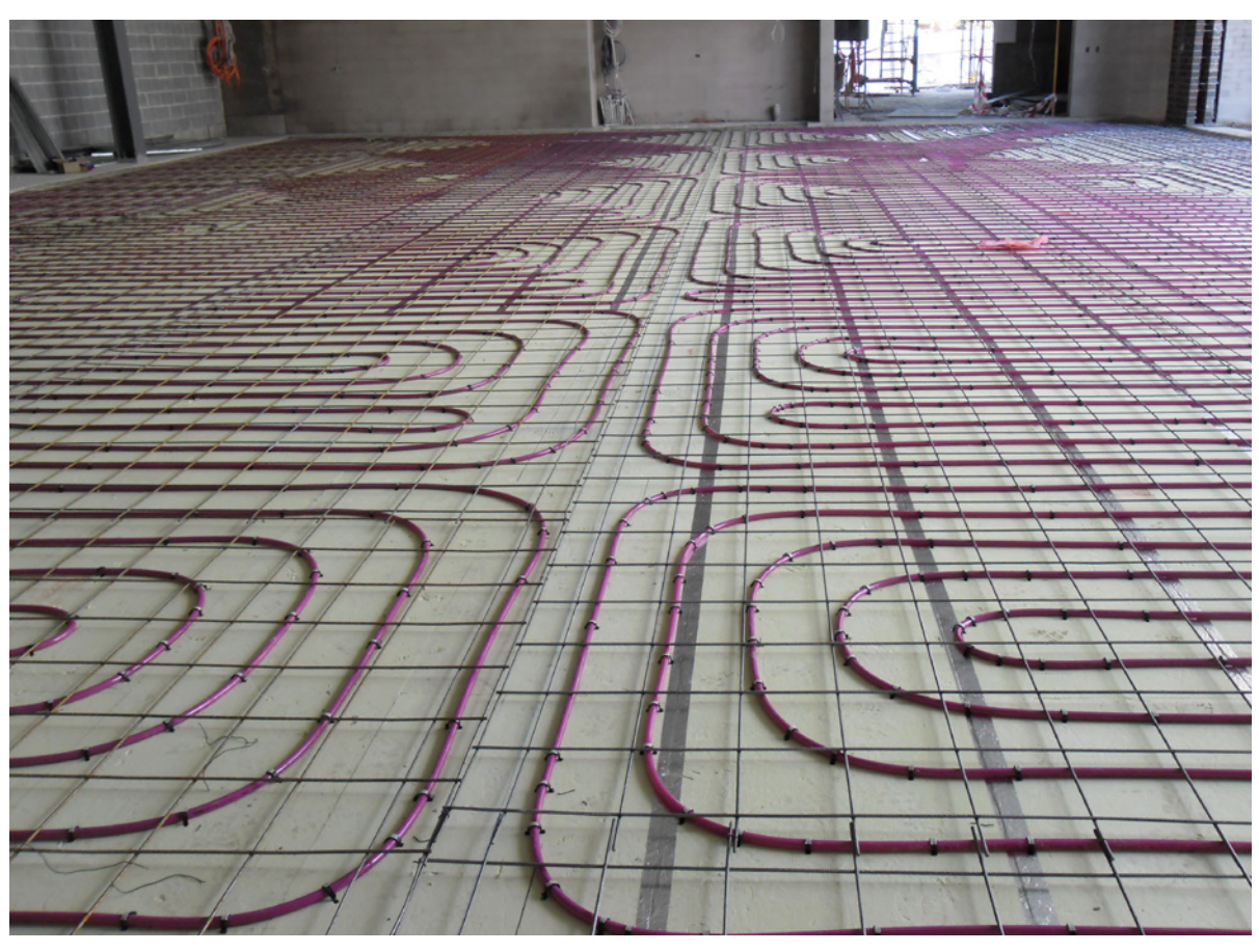
ABOVE IMAGE: COMFORT HEAT UNDERFOOR HEATING TECHNOLOGY

commercial projects alike. Suitable for installation in-slab or on subfloors under various floor coverings including timber, hydronic systems can use heat pump technology to take advantage of convection, encouraging heat to rise up through a space instead of forcing it down. As an alternative to other heating and cooling systems, hydronic solutions utilising heat pump technology offer significant potential for zoned control: instead of automatically heating an entire floor of a building or a whole home, individual rooms and spaces can be heated on an as-needed basis. The versatility of heat pump systems is bolstered by their ability to switch between heating and cooling as well as their easy integration with photovoltaic systems and battery banks, allowing energy to be purchased off-grid.