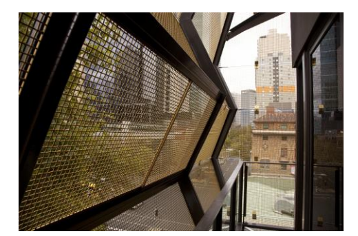
103 Lonsdale St: SJB

Boston 705A Aluminium Mill, Anodised, Powder Coated 2400 mm 30m 72% 3.22 kg/m<sup>2</sup> Custom Made Rigid 3.15mm 17.3mm Sheet