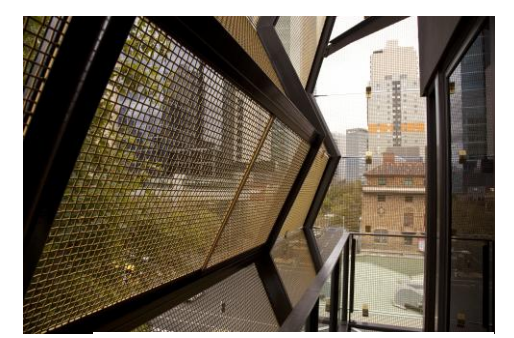
* Typical Architectural Installation

Boston 311 S/S T316, T304, Galvanised Mill, Electro Polish, Powder Coat 2400mm 30m 63% 8.15 kg/m<sup>2</sup> (S/S) Custom Made Rigid 3.15mm 9.8 x 25.4mm Sheet