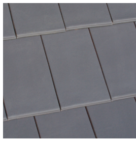
To view colour swatches for each state refer to www.monier.com.au

The ultimate, flat terracotta tile for modern and classic architecture. The Nullarbor delivers streamlined, sophisticated rooflines.