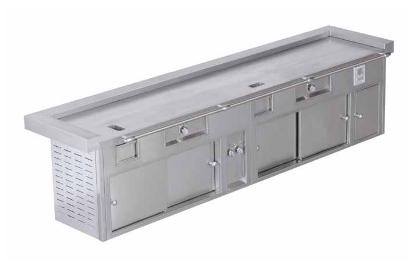
Made to measure wall stove, stainless steel finish, stainless steel and chromium trims, 2 teppanyaki plates, 2 hot cupboards, 2 waste drawers.