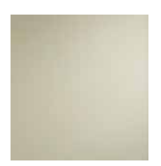
325 SRM Brushed Champagne

HOMAPAL SRM laminates are for vertical and selected low wear horizontal interior application only.