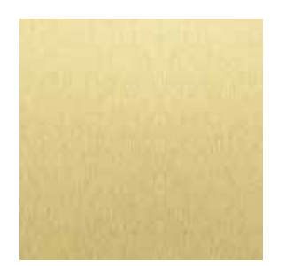
442 RM Brushed Selenio Gold

HOMAPAL RM laminates are for vertical interior application only.