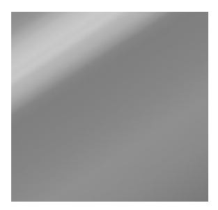
470 RM Mirror Spiegel Silver