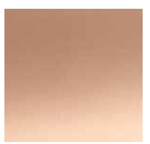
447 RM Brushed Selenio Copper