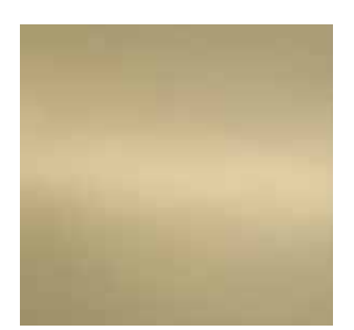
794 RM Brushed Selenio Brass