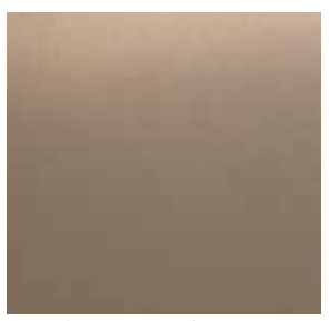
451 (429/000) RM Brushed Selenio Bronze