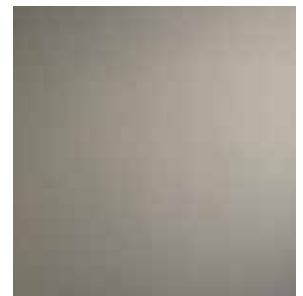
456 SRM Brushed Medium Bronze