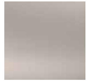
456 RM Brushed Selenio Champagne