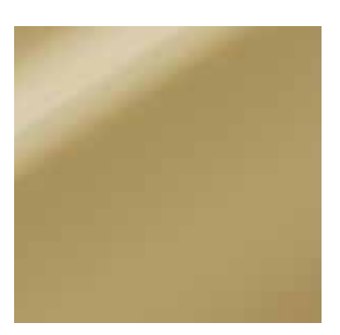
471 RM Mirror Spiegel Gold