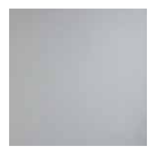
431 SRM Cross Brushed Aluminium