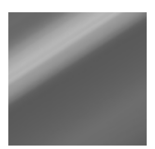
474 RM Mirror Spiegel Smokey Grey