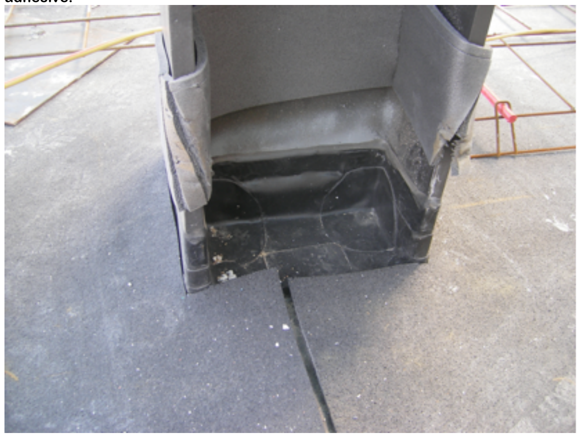
The Wolfin membrane system is sealed to the steel "H" columns that support the covered walkways.

The Wolfin membrane system can be effectively sealed to awkward shapes. In situations where the Wolfin system cannot be mechanically fastened to the substrate (steel, glass, fibreglass etc) the Wolfinsteel is adhered to the substrate with Wolfinator, a construction grade adhesive.