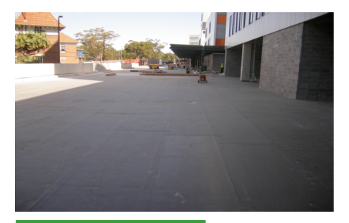
Looking west past the Ambulance parking area

The perimeter curbing was installed over the Wolfin membrane to ensure that the waterproofing of the deck area continued to its extremities without jeopardising the integrity of the waterproofing system.