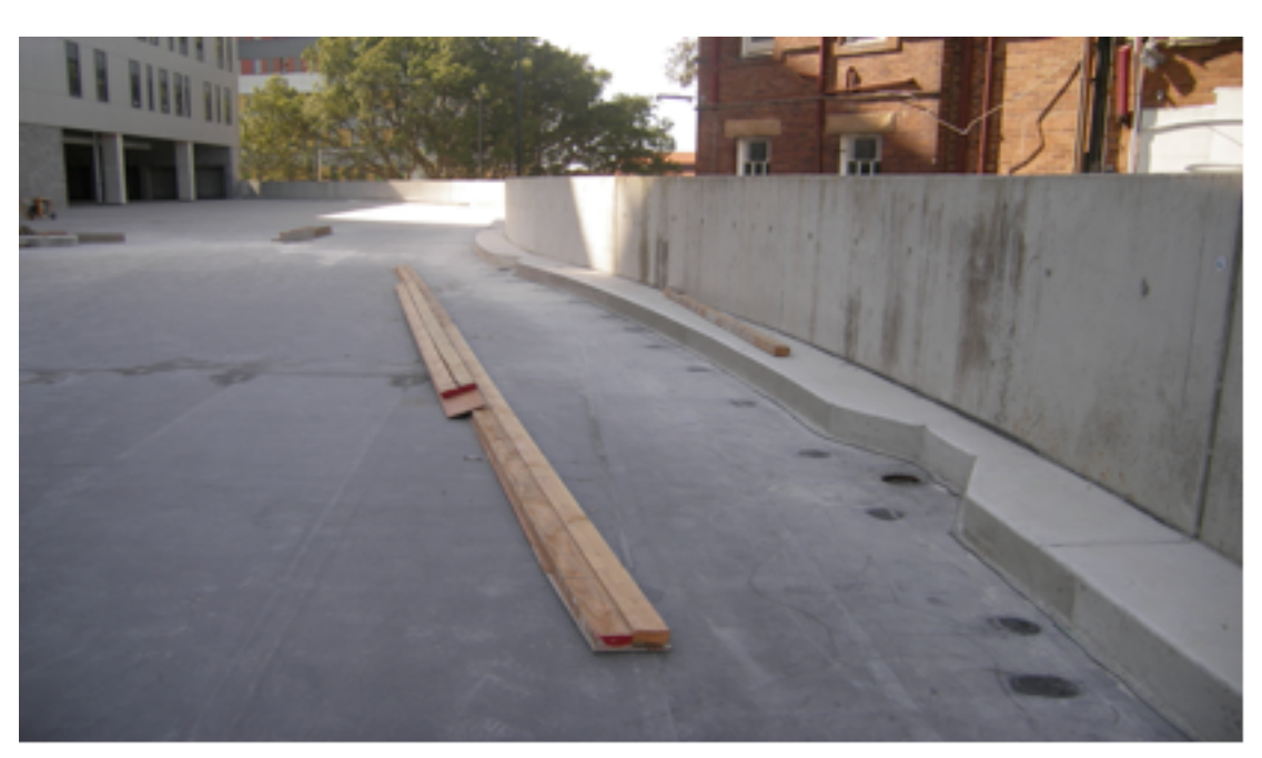
Concrete curbing placed on 5mm Projex Shockmat membrane protection layer

The perimeter curbing was installed over the Wolfin membrane to ensure that the waterproofing of the deck area continued to its extremities without jeopardising the integrity of the waterproofing system.