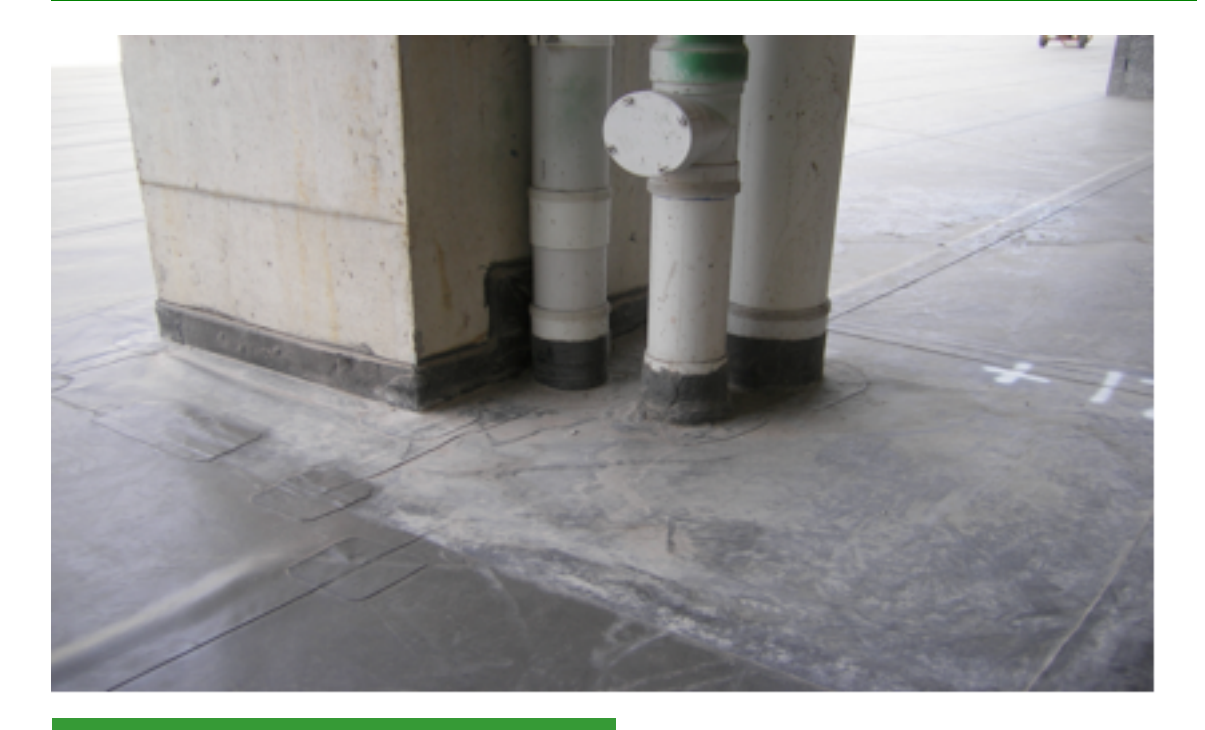
Wolfin IB is welded directly to PVC pipes

Anchor points for concrete curbing and islands have been detailed & waterproofed using standard Wolfin installation procedures. Over 3,500 square metres of Wolfin were used in this area.