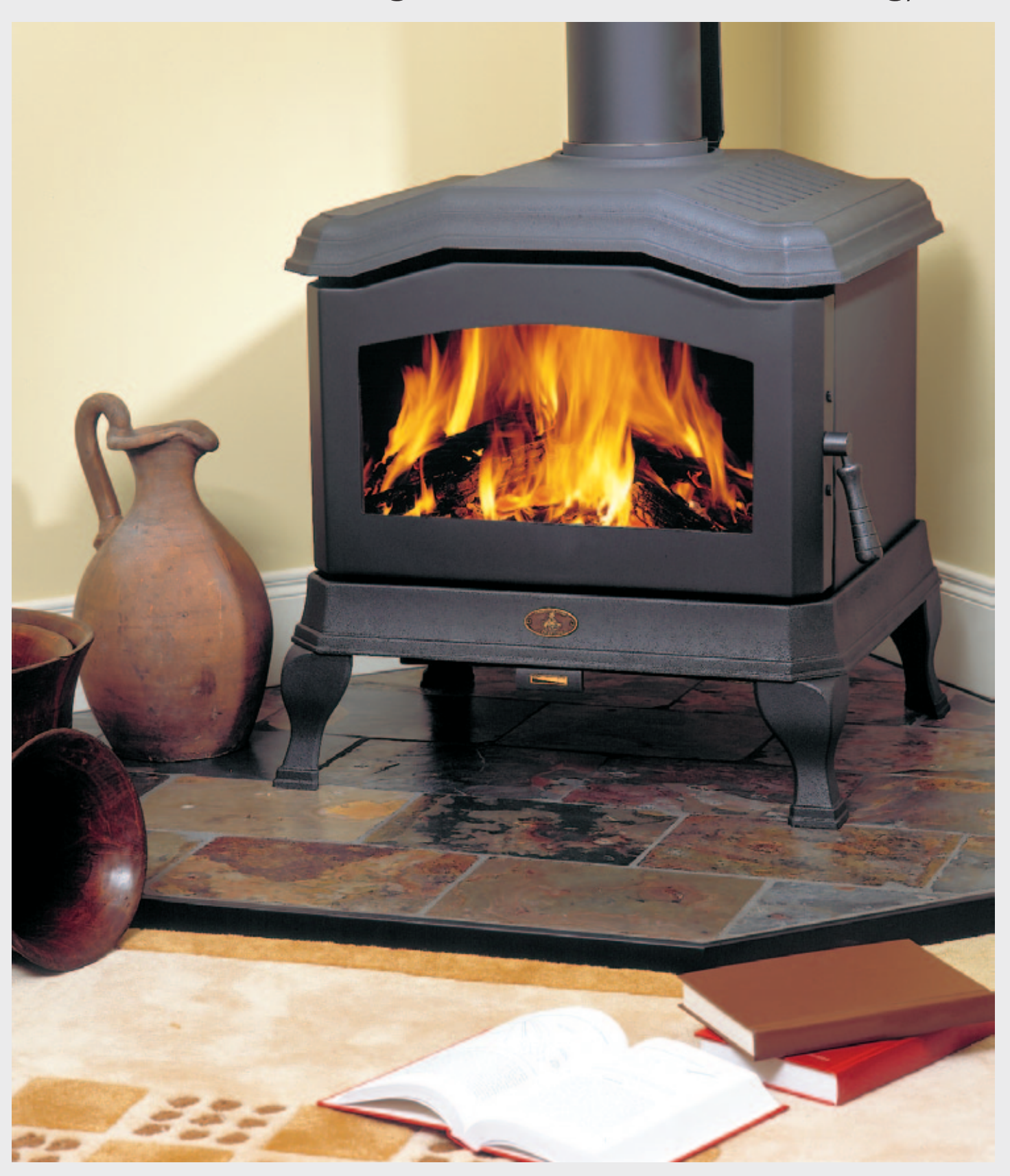
One of the cleanest burning, most efficient wood heaters in Australia.

The hottest thing in wood heater technology