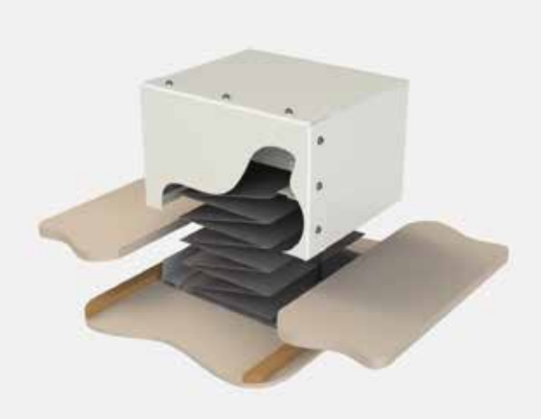
suspended ceiling with SLAT (self levelling access trim) for custom shapes