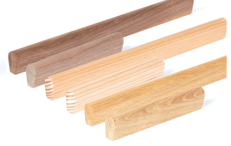
Daintree Full or half round Available in 100mm, 150mm and 200mm diameters

Airlie Pull Handle Available in 150mm and 300mm lengths