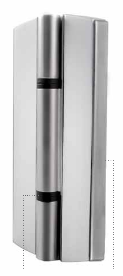
Improved bushes for support increase in weight