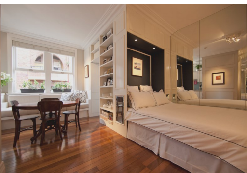
Interfar Furniture Systems Pty Ltd