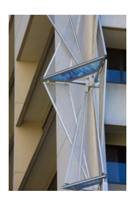
* Typical Architectural Installation