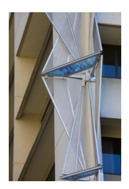
* Typical Architectural Installation